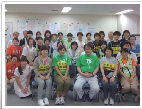
Staff and volunteers at Big Palette Fukushima

JPNA immediately started to collect subscription dues after the earthquake disaster. At the end of December 2011, about 19,520,000 yen was gathered, which was delivered to 1,024 suffering members. 96% of the funds were distributed to the following members as of January 15, 2012; 46 with houses completely destroyed, and 110 with houses partially destroyed, 866 with houses partial damaged, 2 who were deceased. The number of fee exemption members is 1,058 as of January 23, 2012.