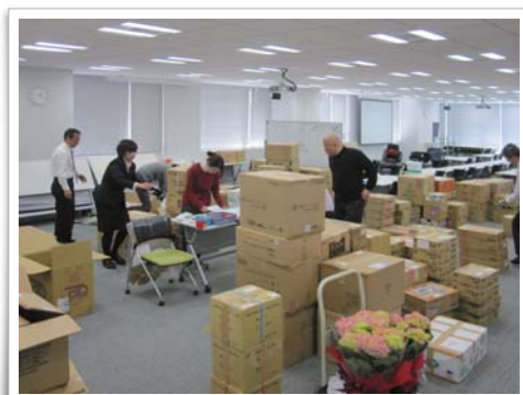
Sorting relief supplies