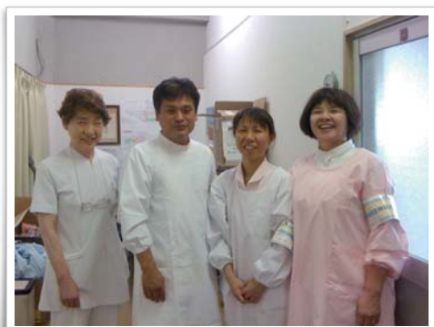
Volunteering in a member institution together with the nurse director

Volunteers were dispatched for projects at the Big Palette Fukushima and in the Soso area based on the request from Fukushima Prefecture.