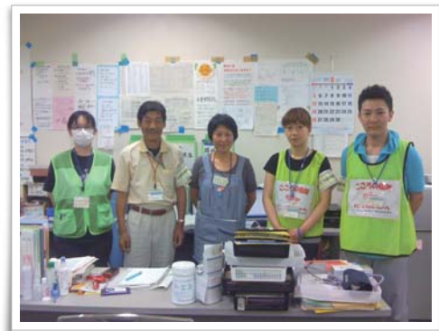
Local health nurses and a volunteer coordinator at Big Palette Fukushima